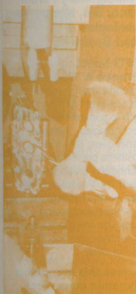
Mg MMC ...