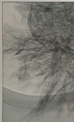
Nanosized Alumina Fibers