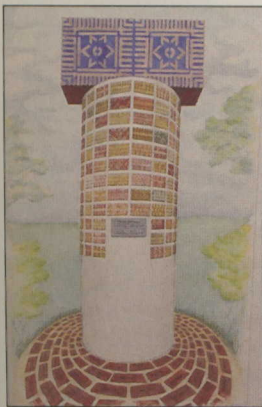
Hawkins, Ohio Brick Industry . . .