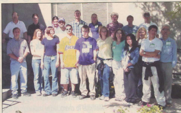
Global News . . .