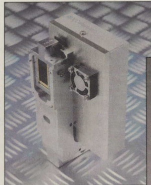
product news ...