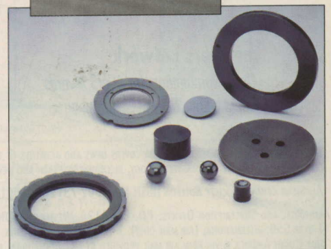
Materials Review . . .