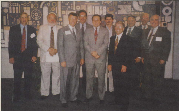
global news ...