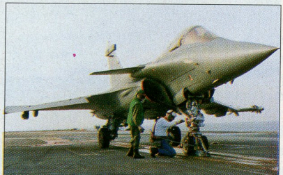
Dassault's Rafale M is designed for carriers