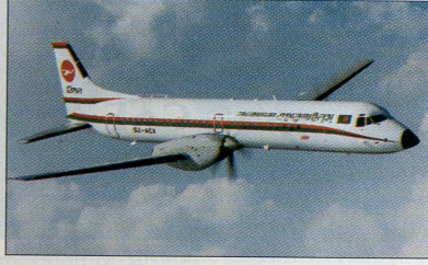
GMG will challenge incumbent Biman