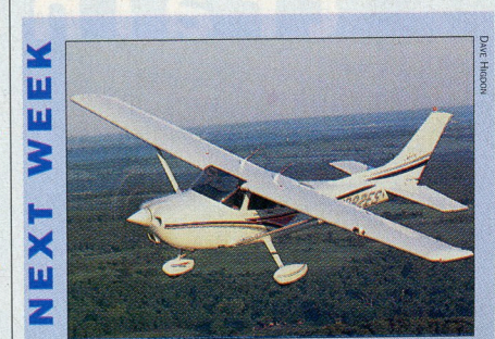
From the small – a flight test of the new Cessna 182 – to the very large – our 1997 ranking of the World's Top 50 Airlines.

The top international marketplace for aircraft, equipment, tuition and jobs.