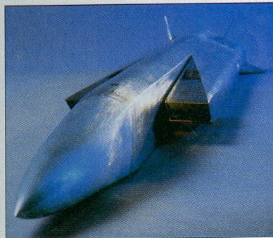
Germany wants cash for its bunker buster

Central Europeans harmonise fighter policies