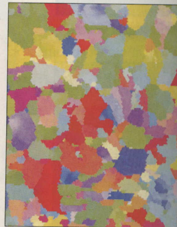
product news . . .

ACerS 105th Annual Meeting and Exposition, Nashville, Tenn., April 27–30, 2003