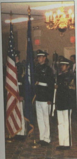
47th Forum . . .