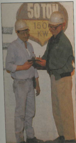
manufacturing briefs . . .