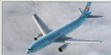
KAL takes on more A300-600Rs