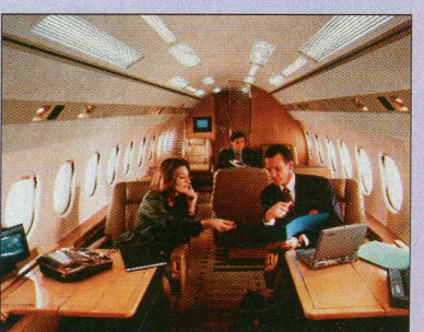
Flight International includes a technical description of France's Dassault Falcon 900EX, with cutaway drawing.