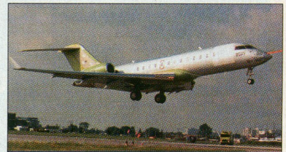
Global Express flight-testing is going well