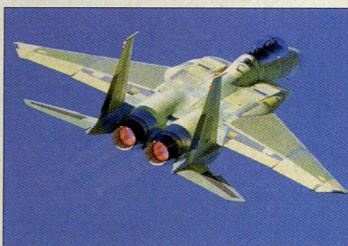
Israel will receive first F-15I on 6 November

Boeing flies first Israeli F-15I Thunderstrike