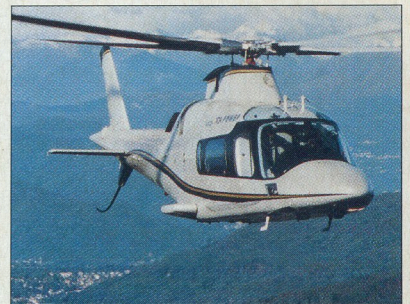
Practical A109 Power is sleekly good-looking