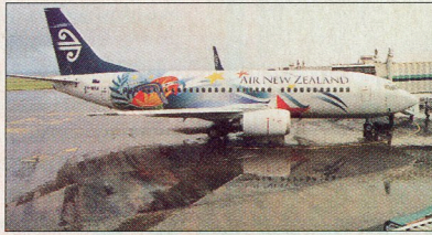
Air New Zealand brightens fleet with 737-300