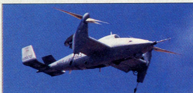
Bell has an Eagle Eye on ousting Outrider