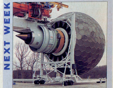
1998 Engine Directory Part 1: Gas turbine engines, civil and military, excluding turboprops and turboshafts, are the focus of Flight International's powerplant review.

The top international marketplace for aircraft, equipment, tuition and jobs.