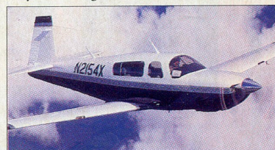
Speedy Bravo delivers that little bit extra