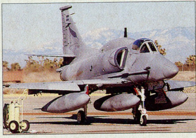
Locally upgraded A-4AR is first of 27