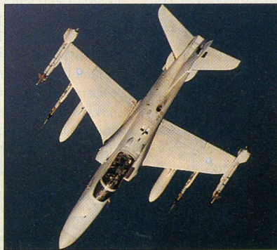
RAAF Hawk purchase will help BaE plan

Budget squeeze threatens naval Taurus 17