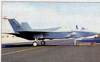
Full-scale X-35 mock-up unveiled at Fort Worth