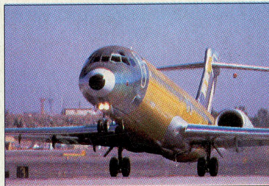
The second 717, T-2, flew on 26 October