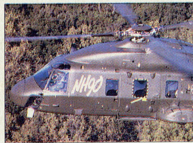
RTM322 and T700 are head to head for NH90