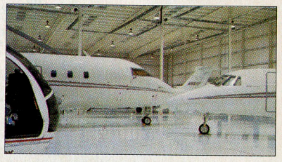
Chain operators are in a strong position