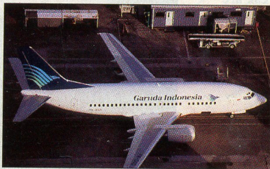
Garuda is renegotiating 737 lease