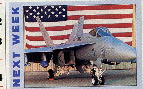
The Flight International F/A-18E/F supplement, Part 2, continues to study in depth Boeings plans for the Super Hornet.

The top international marketplace for aircraft, equipment, tuition and jobs.