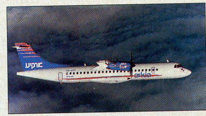
Arkia has opted for ATR 72s on domestic routes