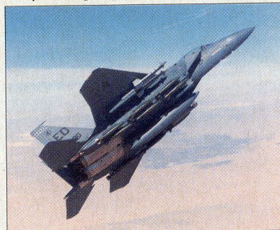
GE drives F-15E engine push