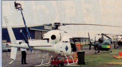
Environmental issues threaten some rotorcraft