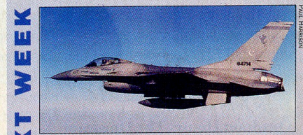
Wanted: a fighter that does not cost more than $15 million, to replace the Pakistan air force's ageing F-16A/Bs.