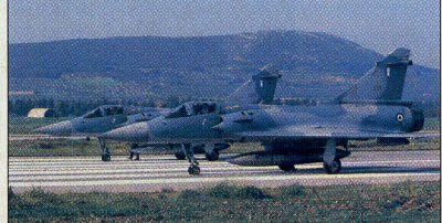
Greece may order batch of attrition Mirages