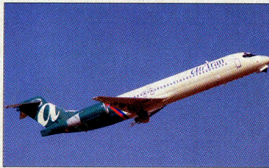
717 is beating its performance targets