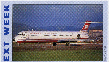
Next Week The 'Year of the Rabbit' has brought Taiwan's airlines diverging fortunes of red ink and new-found wealth.