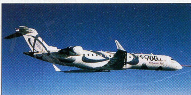
Maersk has ordered three CRJ-700s