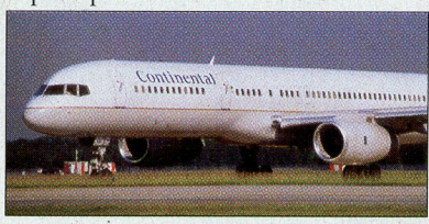
Continental could be in line for new 757