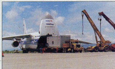
Russia's Volga-Dnepr plans massive expansion