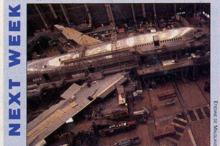
Part three of Flight International's Maintenance Directory covers aircraft repair companies throughout Europe and the CIS states.