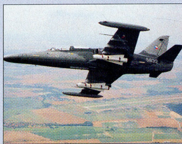
Flight International flight tests the Aero L-159, with which the Czech manufacturer will make its latest foray into the advanced trainer/light strike market.