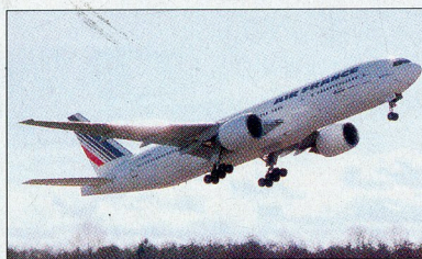
First GE90-94B 77 goes to Air France next year