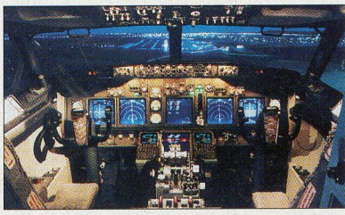
How Classic cockpits may look after upgrade