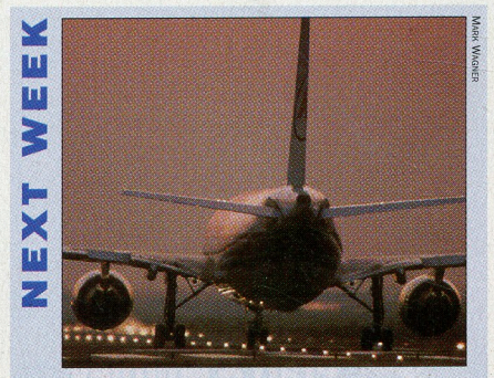
Kenya Airways' privatisation has been a success, but the road ahead for other East African airlines is looking bumpier.