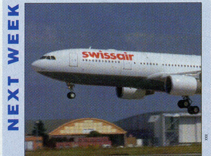
Flight International reports on the Airbus Industrie A330-200's six months in service.