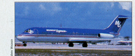
Hushkits are being fitted to Midwest DC-9s

Business airline Midwest Express is thriving