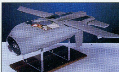
TDI is developing powerplants for LOCAAS

USA urged to review missile ban .. 16 MiG 1.42 fighter poised to take to the air USA considers Python 4 as stopgap ..... 17 USN says door is 'still open' to BROACH USAF chooses LOCAAS power .... 18