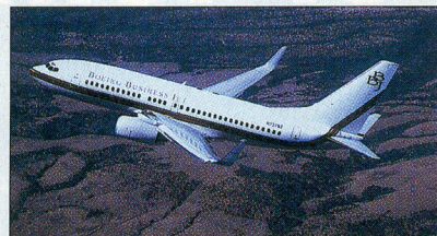
Boeing will offer BBJ training next year

Order boom for Safire jet ..... 26 Eaglet certification pushed back ... 27 BBJ simulator arrives