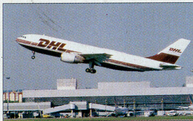
Carriers will be offered A300-600 conversions