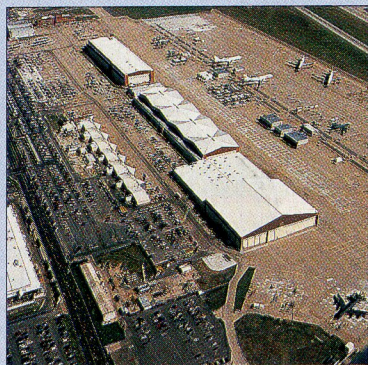
Flight International presents Part One of its annual Maintenance Directory, featuring the Americas.