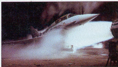
Greece is set to buy 60 Typhoons P14