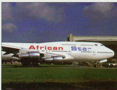
African Star emerges - P14