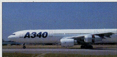
R-R's Trent 500 makes debut on A340 - P12